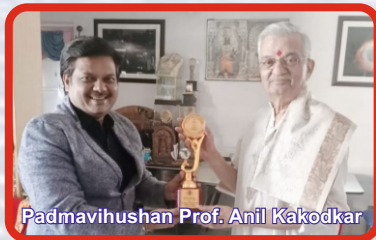
Padmavishushan Prof. Anil Kakodkar