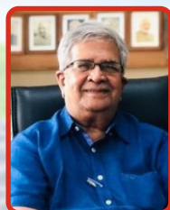
Guest of Honour Sh. Kanubhai M Desai Cabinet Minister

Finance, Energy & Petrochemicals Govt. of Gujarat